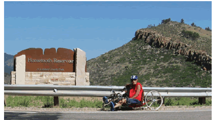
A great view at the top

I'm happy to arrive safely at the bottom and return home with no additional disabilities.