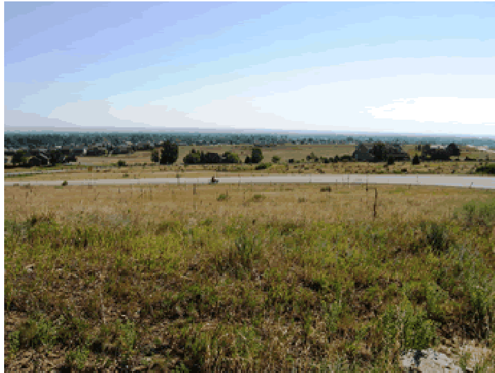
It's a LONG way down